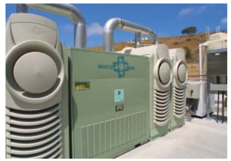
Microturbines at sewage plants create power from biogas while exhaust heat maintains temperature of the sewage digester vats.

Fuel cells are also being installed at landfills and wastewater treatment plants. The technologies used so far are phosphoric acid (PAFC) and molten carbon (MCFC).