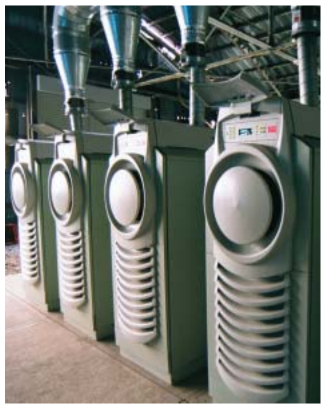
An array of microturbines at a closed coal mine in Japan turns methane into power while exhausting the CO_2 back into the mine.

EPA identified early on the landfill gas opportunity in 1996 and launched the Landfill Methane Outreach Program. It helped increase the number of gas utilization projects at landfills from 162 in 1996 to 330 projects five years later. Still, there is a good potential for further growth.